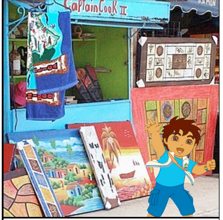
YEAH! LIKE COMPARE TWO COUNTRIES USING THE FIVE POINT FRAMEWORK- HOW ABOUT BOLIVIA AND THE DOMINICIAN REPUBLIC?