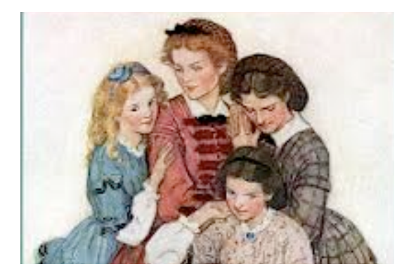
The Little Women with Marmee