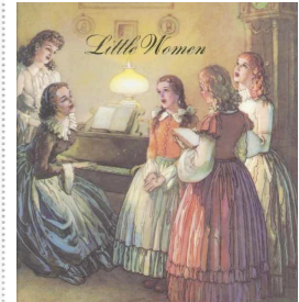
Little Women Book

Little Women was first published in 1668 by the Roberts Brothers. It was such as it that it quickly sold out its first 2,000 copies!