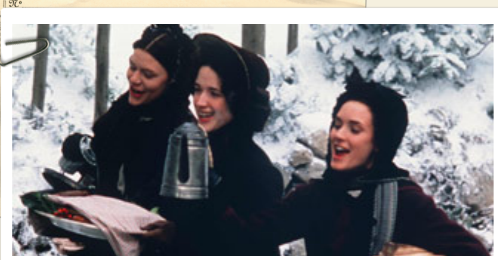
Little Women Movie (1994)