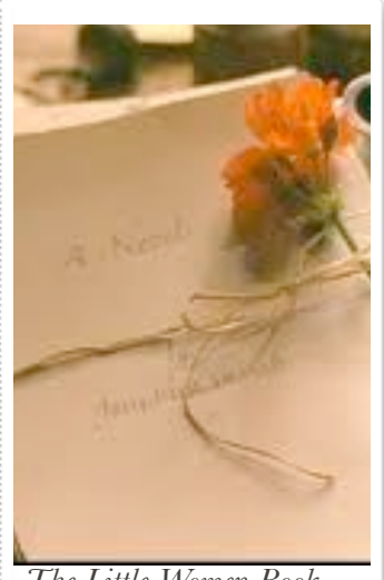
The Little Women Book