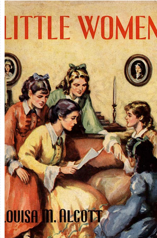
The Little Women Book