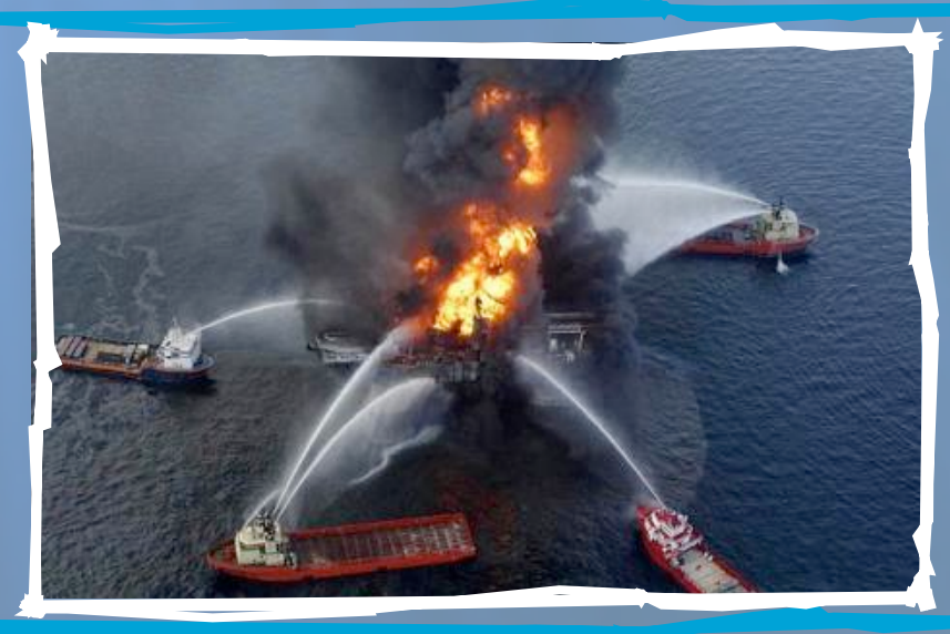
Boats putting out fires that were intentionally set to reduce the amount of oil.

This stock market price of BP. The far left is the beginning of the oil spill and the far right is the end of the oil spill.