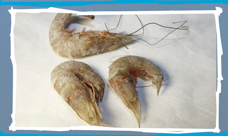
Eyeless shrimp, one of the many seafood deformities found along the coats after the oil spill.