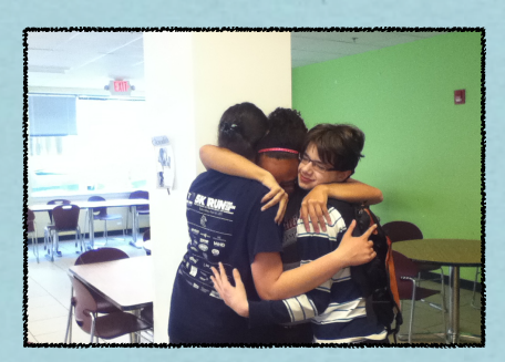
A celebratory hug with two members during a particularly heartwarming session.