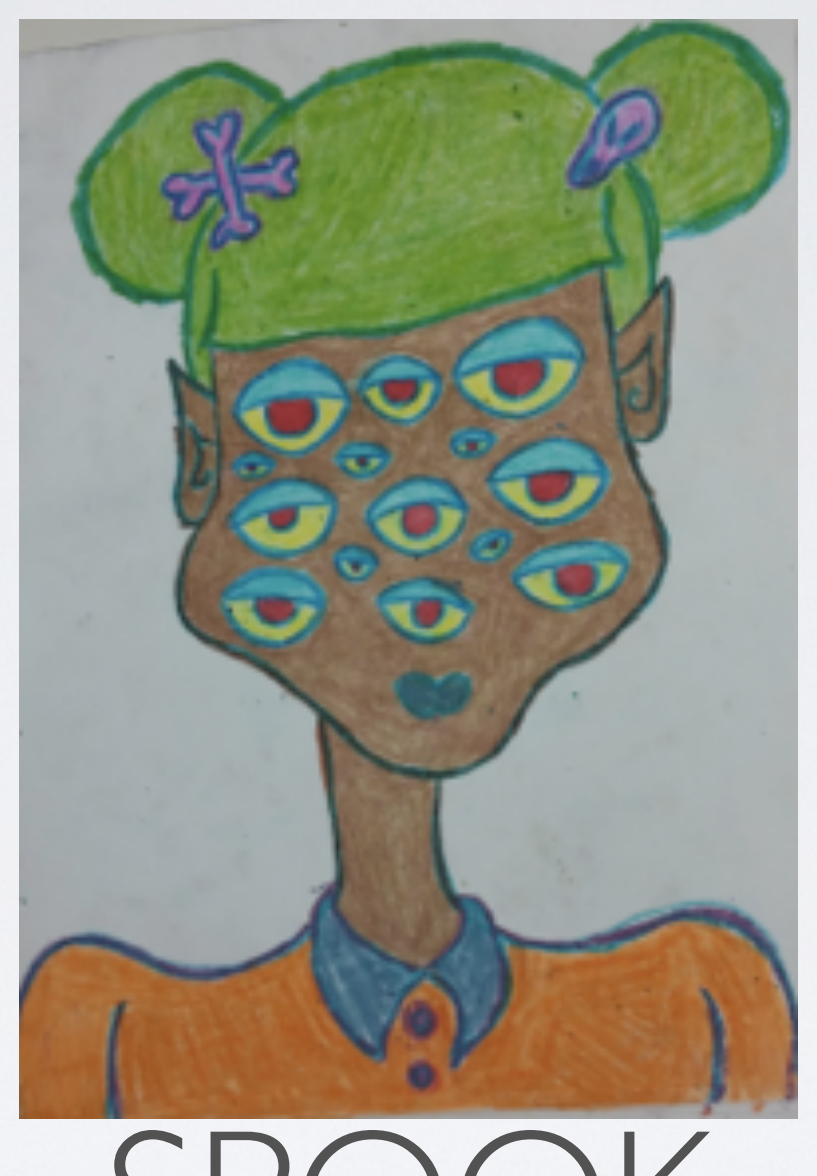
SPOOK CRAYON ON WHITE PAPER