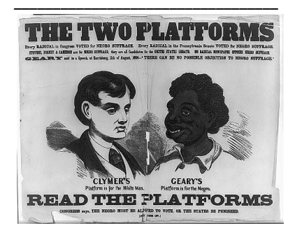
White Man Vs Negro

Another reason to support many of the African Americans, especially down south, is to fix the mess this war has created. We need to stop lynchings and the awful treatment of African Americans. We also need to become a union again and have support from the entire country. We need to reconstruct the south!