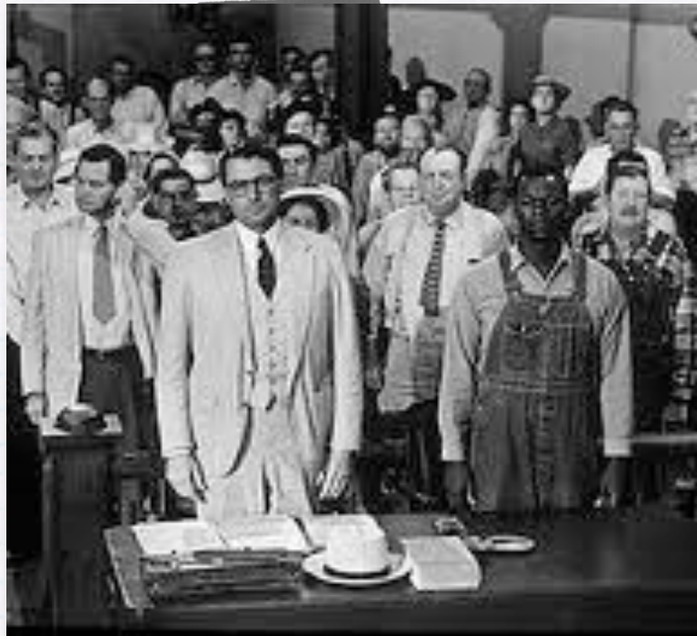
Atticus Finch and Tom Robinson

Can you imagine if we lived in a town with more Bob Ewells, its already frightening with one Bob Ewell. We would fall apart but even then, one Atticus could maybe not change it, but