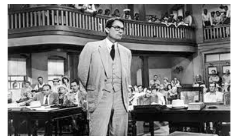
Atticus Finch's Closing Statement