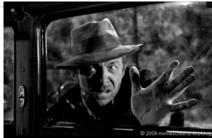
Bob Ewell Sneaking into Judge Taylor's House