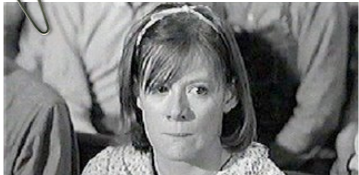
Her face revealed a story that was untold

Mayella's statements are not true and shouldn't be used against Tom. Why should the court even believe Mayella's accusations, her body language showed that she was holding something back.