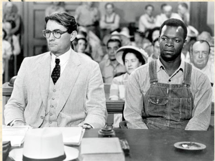
Tom Robinson and his Lawyer at the trial

November 21, 1936 was the Tom Robinson trial. The trial was to see if Tom Robinson was guilty or not, but I thought he was innocent. Although, the jury found him guilty as charged. It was truly an emotional trial. Mayella was talking about her being hurt by Tom, even though it was clear she was lying about everything. Not fully answering to questions, hesitating to speak along with stuttering and sweating. Tom was giving solid, straight answers to each question. With no stuttering or hesitation. My Dad put a really convincing argument for Tom Robinson, but the jury thought otherwise.