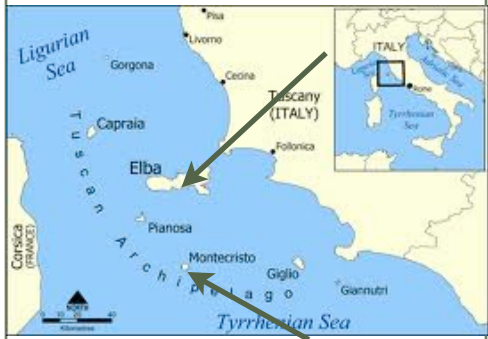
A map of the Tuscan Archipelago, including the Isles of Elba, where Napoleon was exiled and to where Dantés delivered a letter to, and Monte Cristo, where the immense treasure Dantés acquired was stored. He also named himself after it, the Count of Monte Cristo.

I could relate to some things in the story, but not