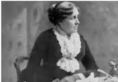
Louisa May Alcott, Author of Little Women