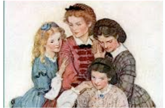
The Little Women with Marmee

Just as Joe tries not to become infatuated with love, I also mimic that technique because I would want focus on more important things and just wait on the one who God has for me. Upon reading this book, almost anyone will be kindled at the heart, once peering into the lives of these four young women. Little Women will leave you touched with grace, gratitude, humility, spiritually, and love for the ones who are dear to you. Once, the “little women” had learned to be appreciative of each other, they served others even though they didn’t hold much themselves. They loved each other because they knew not if one of them would leave the world forever. Because of the state that they had to endure, they learned that virtue is far more precious than rubies. I encourage you, despite all of the things you may have or you don’t have, use their lives as an example. Be humble, appreciative, gracious, and charitable, just as the little women were, because they learned it from the best teacher, God.