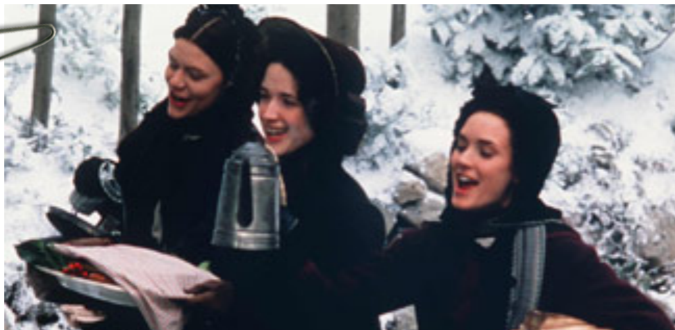
Little Women Movie (1994)