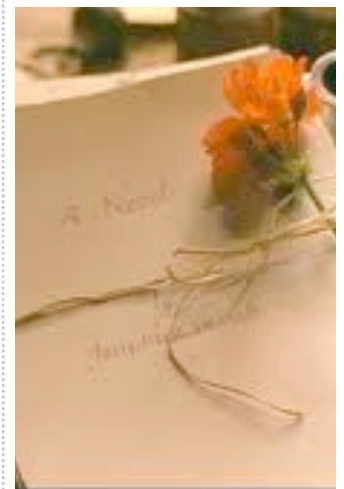
The Little Women Book