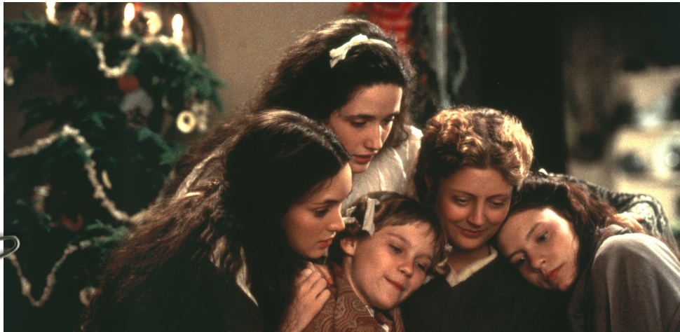
The Little Women Movie (1994)