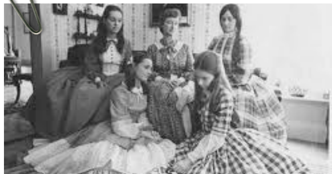
The Little Women