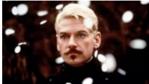
He is stuck on what to do; worried