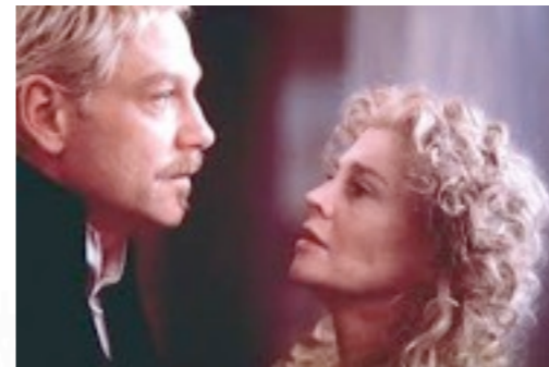
Pain and Heartache

“To die: to sleep; No more; and by a sleep to say we end The heart-ache and the thousand natural shocks That flesh is heir to, 'tis a consummation Devoutly to be wish'd.”