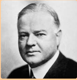
Herbert Hoover- President 1929-1933 Republican