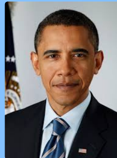
Barack Obama- President 2009-2017 Democrat