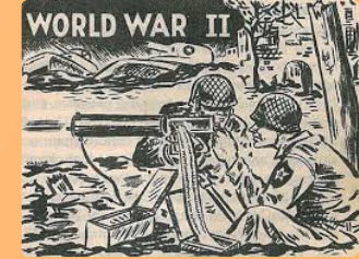
WORLD WAR II