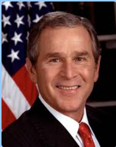
George W. Bush- President 2001-2009 Republican

Another parallel between these two economic disasters was the administrations. President Hoover believed that businesses should take care of themselves and that the government shouldn't help. When that didn't work, president Roosevelt implemented "The New Deal", a series of long term and temporary government programs to fix the problem. This cycle was repeated again with Bush and Obama. When the housing market crashed as a result of risky investments with dirt cheap government loans, President Bush decided that the best course of action was to bail out companies and banks that were "to big to fail". However, this approach didn't have much effect on the economy. Obama began his presidency promising to take the country out of the recession using methods similar to Roosevelt.