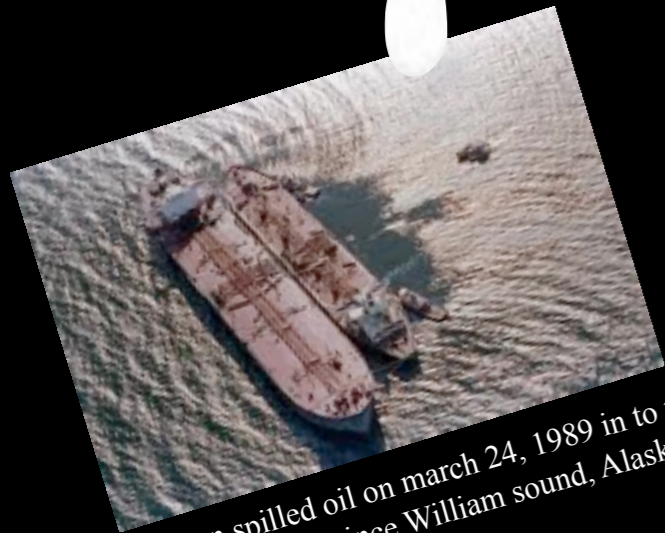
Exxon spilled oil on march 24, 1989 in to the Bligh reef in Prince William sound, Alaska.