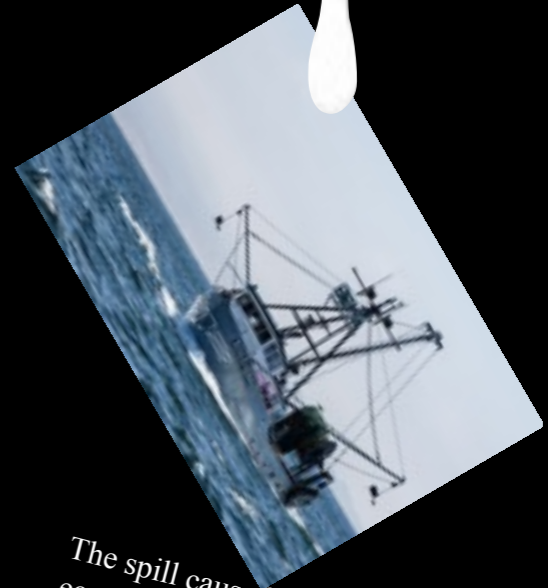
The spill caused over $300 million of economic harm to more than 32 thousand people whose livelihoods depended on commercial fishing