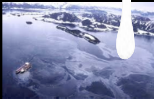
Spilling 10.8 million gallons of oil of it's 53 million gallon cargo