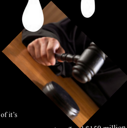
Exxon was then fined $150 million, the largest fine ever imposed for an environmental crime