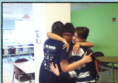
A celebratory hug with two members during a particularly heartwarming session.