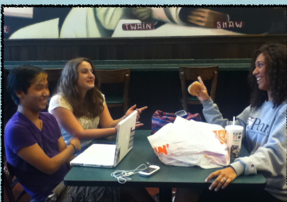
A meeting with the book club committee discussing ideas for the year ahead. Yes - I bought donuts.