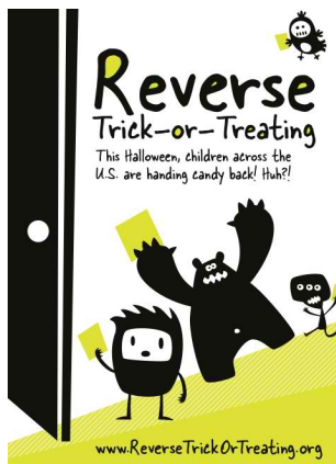
An example of the Reverse Trick-or-Treating brochure

Greetings! Welcome to my third and final blog post of the You and the World Project! So far in this project, I have completed blogs number one and two , and the agent of change project. For the entire project, I have been focussing on the issue of child slavery in the chocolate industry. If you haven't read my first two blog posts, make sure you do! This blog will be all about documenting our agent of change portion of the project, which I will explain more about. This is also the last stage of the project! I hope you enjoy this blog post as much as the others!