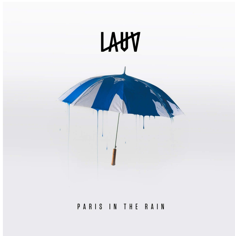
From the album I met you when I was 18 . By Lauv

I chose Paris in the Rain by Lauv as the song for this scene because when Rafe suggested to Grace that they should take a hike to relieve Grace's stress and so she agreed and they took a nice hike while Rafe was having a "heart attack" when they finally got to their destination. They decided to sit on the hood of Rafe's car and just talking about how life is going. When Grace suggested that Rafe should talk to Joaquin because to "help" Joaq with "finding" his identity/race Rafe agreed but while he agreed he saw that Grace was chewing on her straw like a beaver and told her to stop as he took her straw from her milkshake, Grace tried to grab her straw back from Rafe but led to Grace on top of Rafe. Grace at that time felt like she was in a TV-show and was supposed to kiss him, she did want to kiss him but didn't, they got up and apologized to each other and sat back on the hood of Rafe's car while Rafe wrapped his arm awkwardly around Grace.