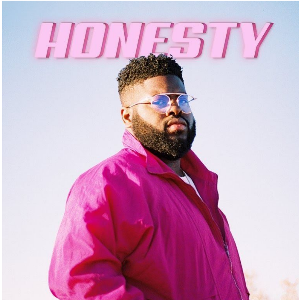
From the album Honesty By Pink Sweat$

I chose Honesty by Pink Sweat$ as the song for this scene because when you hear the song and see the lyrics of this song it goes really well with how the story goes. When you imagine Maya jogging to the park wanting to see Claire, feel her (not in a weird way), smell her (also not in a weird way), and hug her, this song will fit in perfectly with that scene.