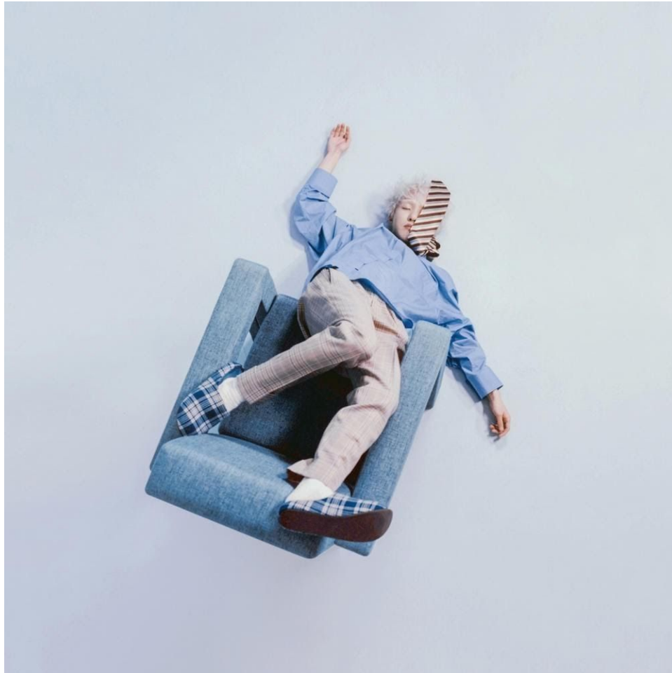
From the album ZZZ By Zion T.

I chose Hello tutorial by Zion T. & Seulgi as the song for this scene because after the incident happened with Birdie and Colin things got awkward between Birdie and Joaquin. So when Joaq saw Birdie at his party he was surprised why she was at his party then Birdie explained why she was there (Grace and Maya invited her) he was shocked that Maya and Grace could do that to him but he was glad that Birdie was there.