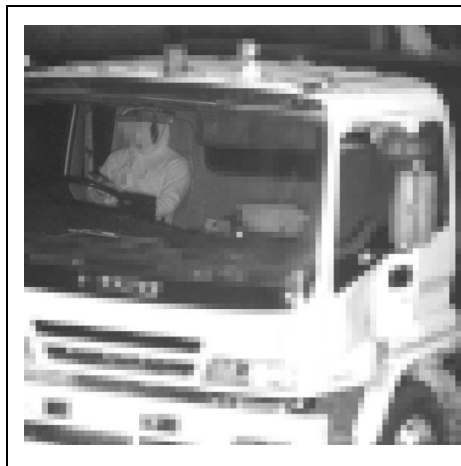
Truck driver accused of hitting single mom of 3 caught on camera