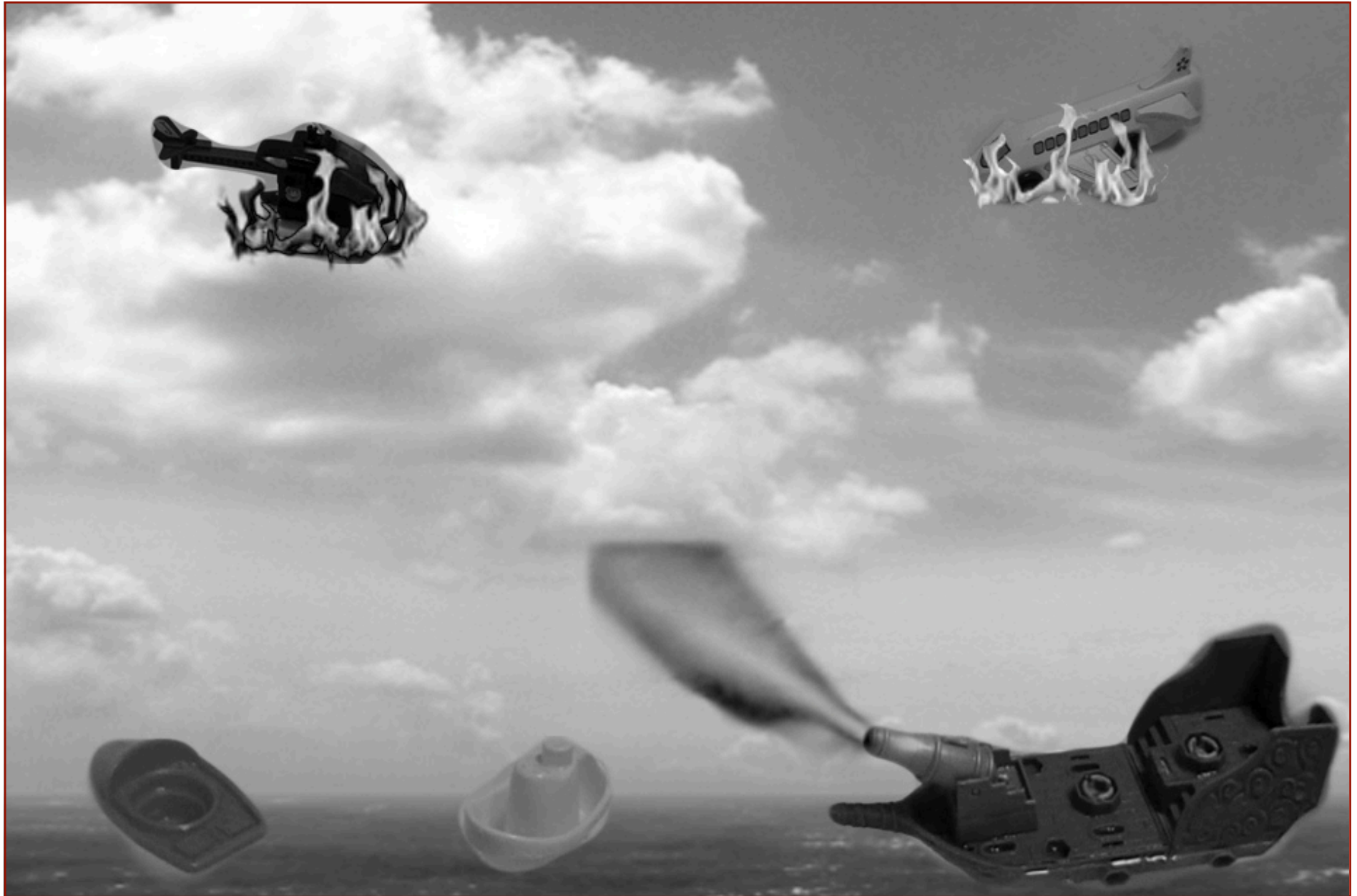
The picture above is of the pearl harbor attack. Two Japanese planes on fire as a US naval ship shoots them down.